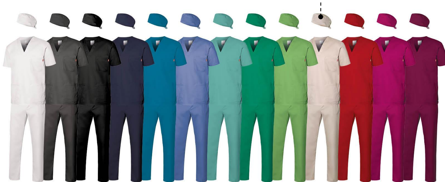
Stretch scrub cap (Ref.:534006S)